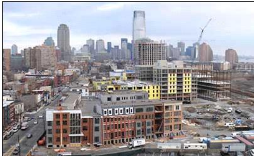
Figure 10: Liberty Harbor North Project, Jersey City, NJ

Reduction in parking requirements is applicable to all type of uses in the Jersey City redevelopment zone (i.e. residential, commercial, office, retail, etc.) These numbers are further reduced for areas which are served by one or more transit lines. For Example, an office requires four spaces per thousand square feet as against nine spaces per thousand square feet of area.