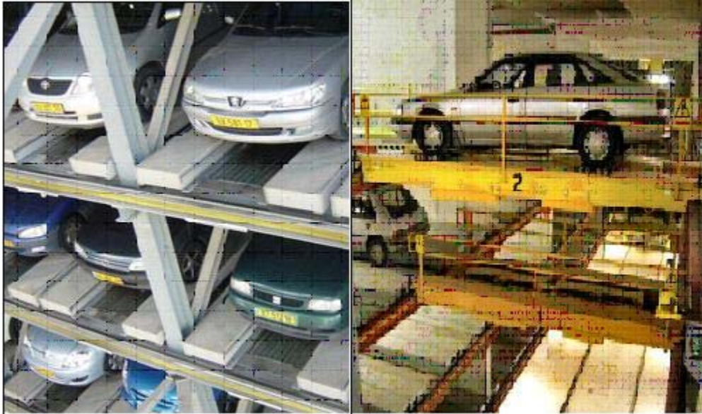
Figure 8: Automated parking facility, Hoboken, NJ

Automated parking facility in Hoboken uses robotic technology facility which accommodates more cars in less space thereby economizing on space for parking.