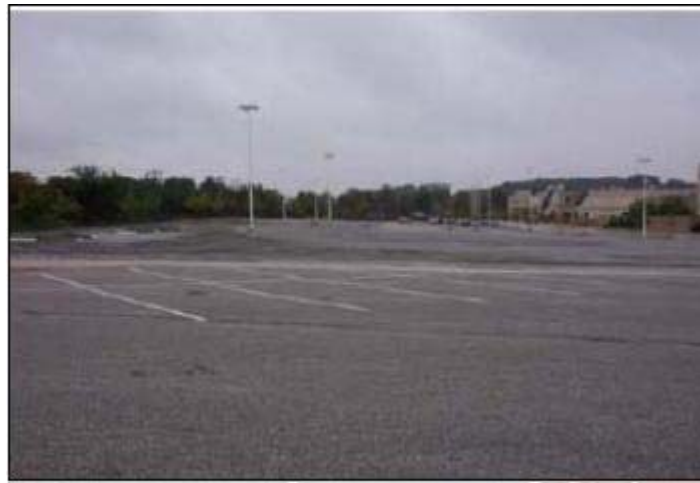
Figure 3: Vast open parking spaces

Parking provisions in the zoning codes have further enabled our car centric culture. These standards are being followed as a legacy by our land use planners and local officials. There has been little effort in amending these provisions or changing the basis of formulation.