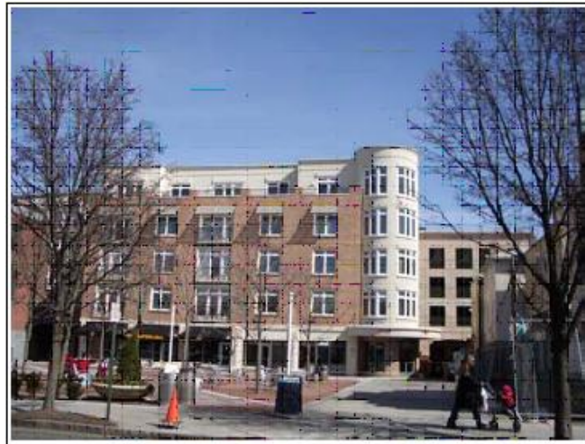
Figure 7: Structured Parking design, Princeton, NJ

Local jurisdictions may use public financing that can involve the use of municipal bonds. Parking revenues, lease payments, benefit assessments may be used to secure bond payments. For example the New Brunswick parking authority finances its parking decks with municipal bonds. The Ferren deck in New Brunswick is a good example where office and retail income support the financial operations of the parking component. Design of parking facilities is another aspect of parking. An intelligent and efficient design of a concrete parking structure can either make a development either car friendly or pedestrian friendly. The placement of a garage and its orientation in integrating with adjacent land uses, all affect the character of the neighborhood. Cranford, NJ has wrapped its deck with housing and retail; Princeton uses a stainless steel mesh which has a very modern appearance.