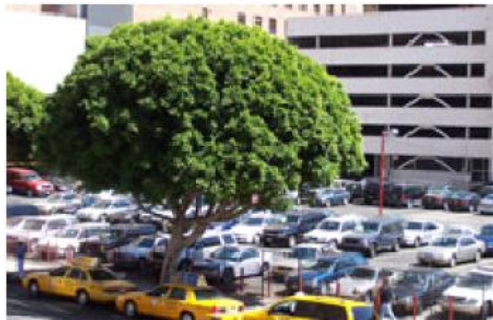
Figure 1: Parking Deck and Open Parking Spaces

Parking provides access to diverse destinations. It is considered a by-product of any development. Our attitude towards parking is visible in the form of large paved open surface parking lots and structured parking decks. These spaces provide “low cost housing for our cars”, where they spend ninety five percent of their time (Shoup, 2005). Eighty one percent of our trips are made by car and ninety nine percent of the time we have the luxury of using free parking (Shoup, 2005). Abundance of free parking is an important cause of increased auto use (Willson 1995, Shoup 2005).