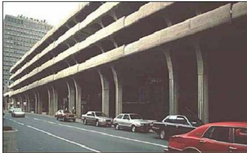
Figure 2: Roadside Parking Deck – Does not blend with the surroundings

Land use policies and zoning ordinances play an important role in guiding the development of parking standards for the city. These codes include development standards (such as width of aisles and parking stalls, minimum lot requirements, lighting requirements, etc) and planning standards (such as number of parking spaces for a particular use, building height, setbacks, etc). There is little which can be done to alter the development standards, however there is potential to reform planning standards based on individual characteristics of the municipality (city/town/village).