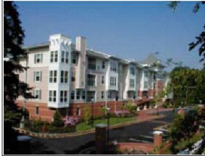
Figure 6: Gaslight commons, South Orange, NJ

Demand management through shared parking is another strategy widely seen in many municipalities. The City of New Brunswick, New Jersey adopts a shared parking provision to fulfill the off street parking requirement for different uses in the downtown. Please refer to the appendix for shared parking provisions for the City of New Brunswick. Montclair, NJ, has been at the forefront of innovative commercial parking standards. Their standards allow for shared parking. Shared parking allows spaces to be used during different time periods throughout the day in areas where mixed use development makes this possible. In Montclair, entertainment destinations use shared parking on evenings and weekends, while commuters inhabit the spaces during workday hours. The Rahway parking authority has shared parking provision between commuter lots and nearby residential.