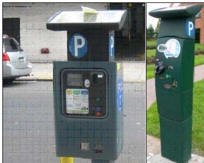
Figure 9: (Right) Parking meter in Village of Port Jefferson (Left) Muni-meter parking in NYC

Some of the other parking practices which have been successful in improving the efficiency of the parking are as below.